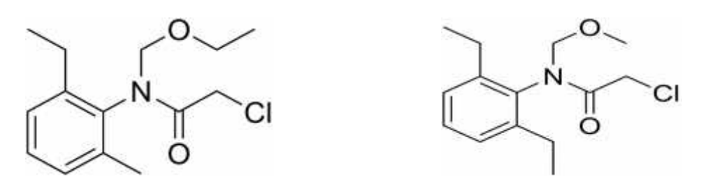
Figure 1: Structure of acetochlor and alachlor