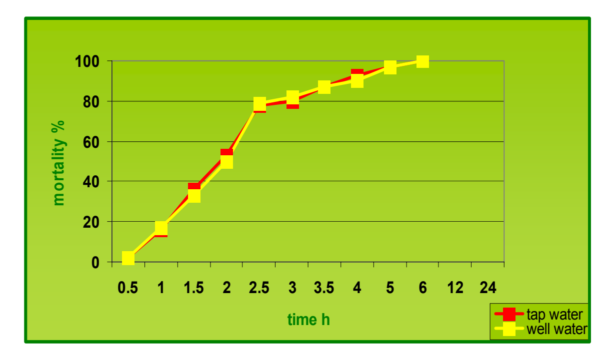
Figure 2: Mortality of Myzus persicae caused by mixture Actellic-50+Antracol WP-70 in different water