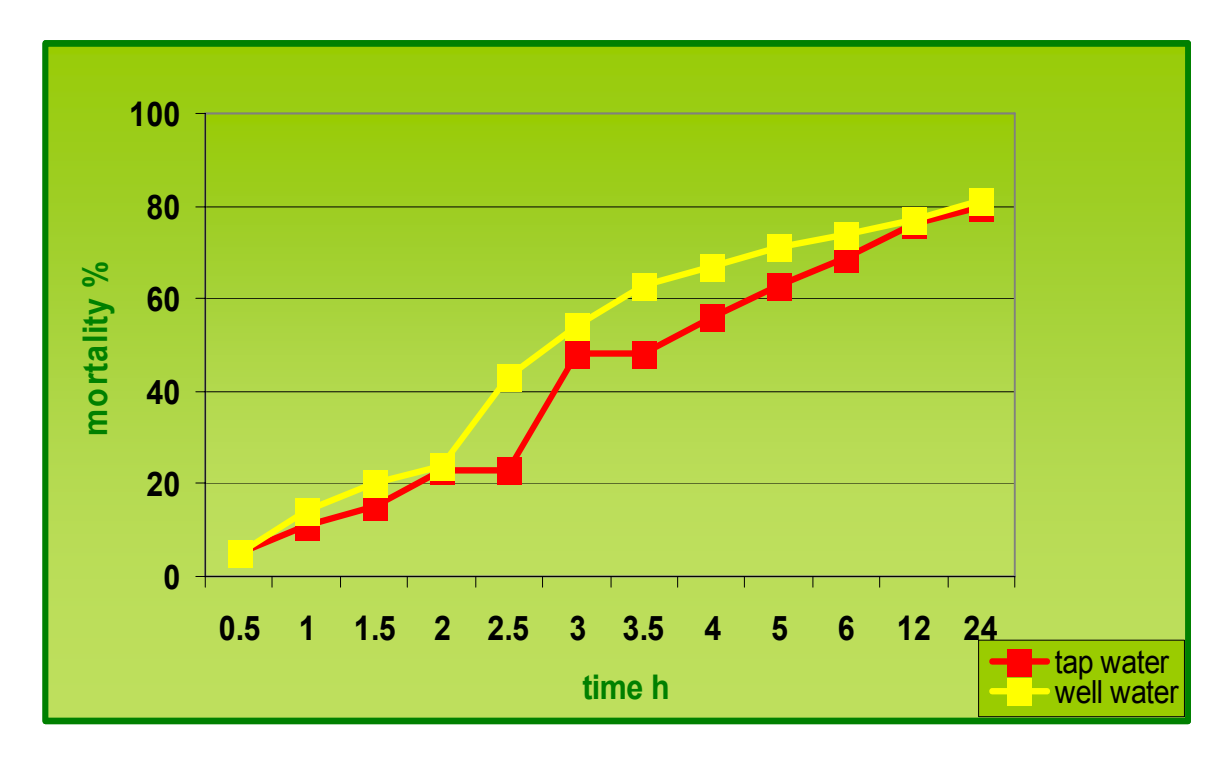
Figure 4: Mortality of Myzus persicae caused by mixture Actellic-50+Antracol WP-70+Ferticare I in different water