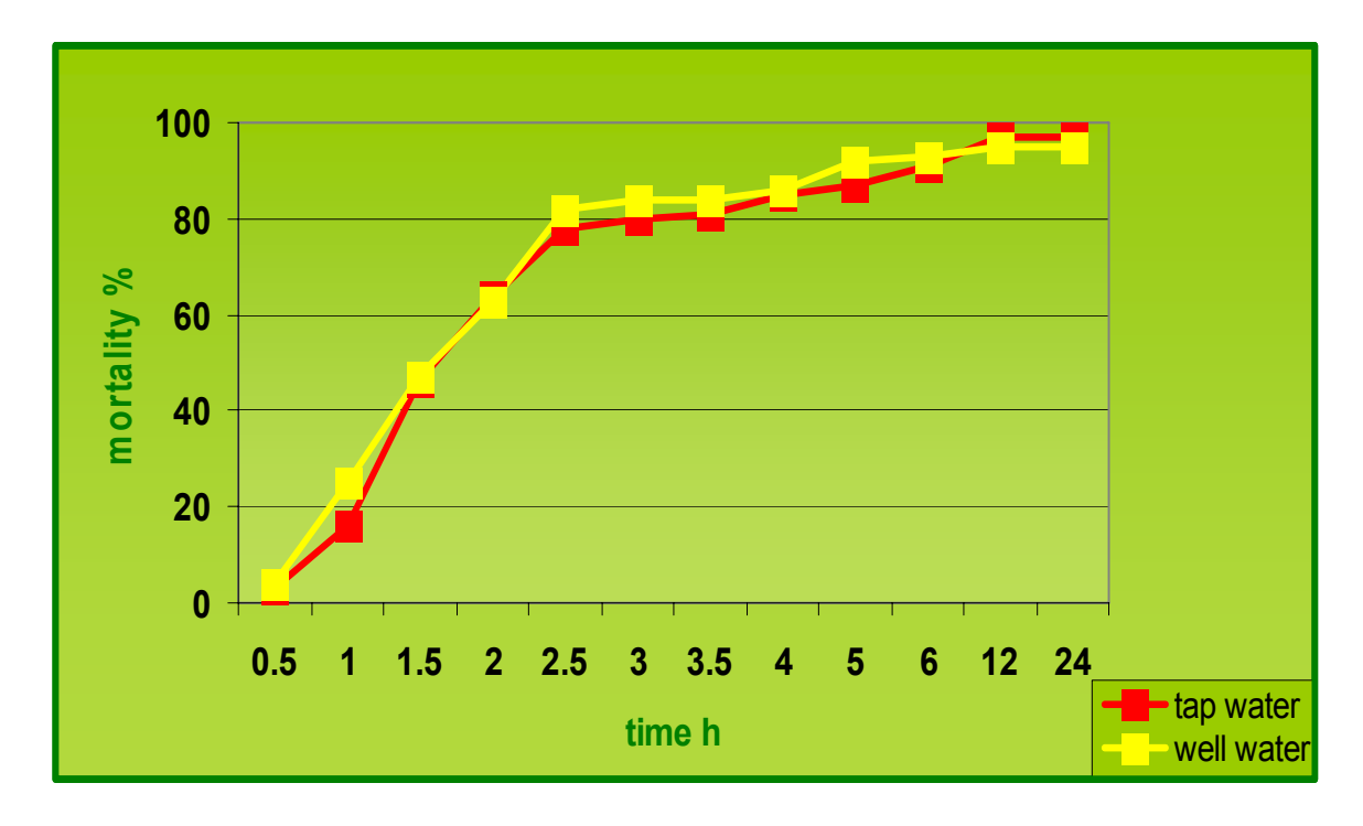
Figure 3: Mortality of Myzus persicae caused by mixture Actellic-50+Ferticare I in different water